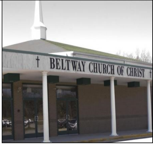
“BUILDING UP A SPIRITUAL HOUSE” “CHOSEN PRECIOUS” I PETER 2:5