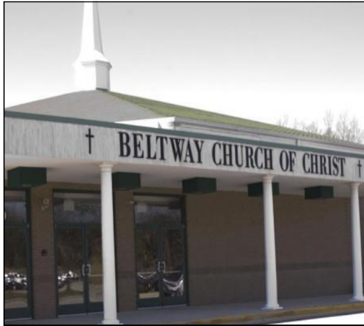
"Seeing All Things From God's Point of View" Colossians 1:9-10 2019