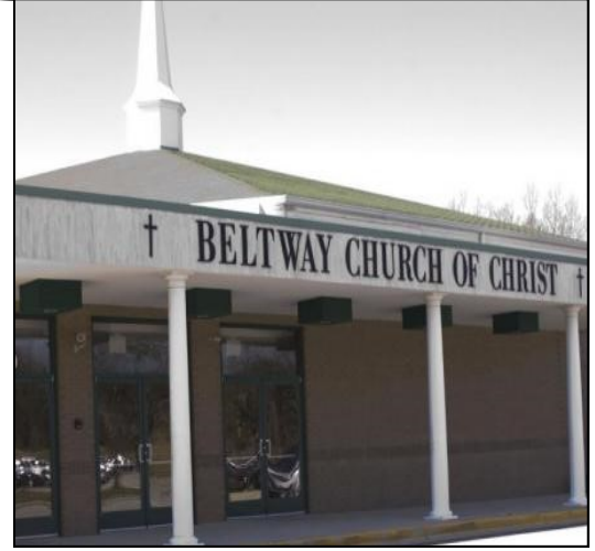
“BUILDING UP A SPIRITUAL HOUSE” “CHOSEN PRECIOUS” I PETER 2:5

Sunday, December 6, 2020 Welcome Visitors We are honored that you have chosen to worship with us today. Please stop by our visitor table in the foyer.